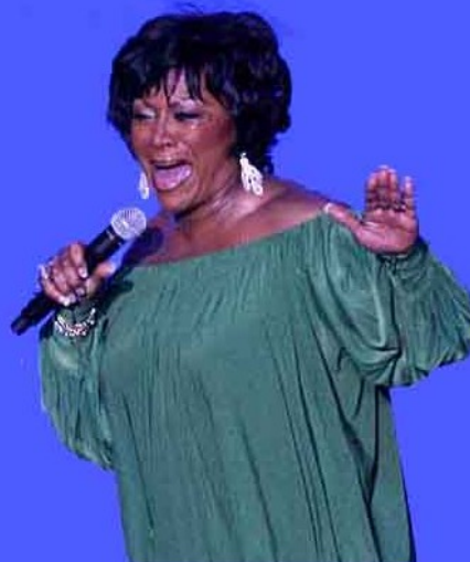
One of the music world’s most accomplished and honored singers, Patti LaBelle, will be performing at Pride In The Street on June 11. Here she is at a 2008 concert.

Photos Celebrating Pittsburgh’s Arts/Entertainment History & Community