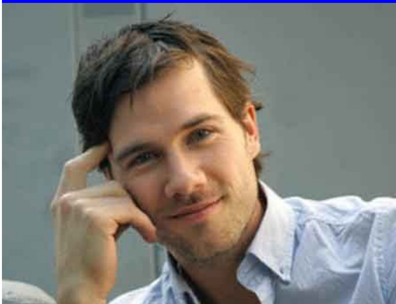
Best known for appearing in TV's "Brothers & Sisters," actor Luke Macfarlane will be starring in a local production of the play "Sam Bendrix at the Bon Soir" at City Theatre starting in November.

Photos Celebrating Pittsburgh's Arts/Entertainment History & Community